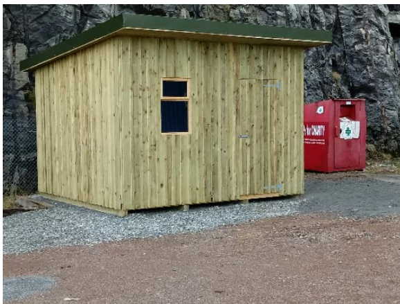
New Lochinver Food Larder