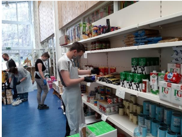
Food bank images from Lochinver