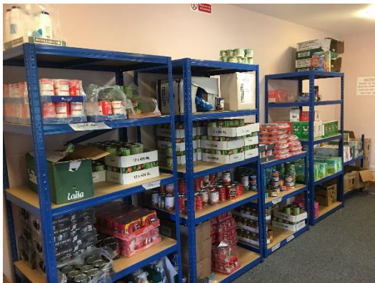
Food bank in the village hall

We are still in the village hall in 2021 and are still providing food bags of both fresh, tinned, dried goods to appreciative locals. We have had a several new people who have come online due to the continued covid restriction and lack of working opportunities in the area. See images below of food available.