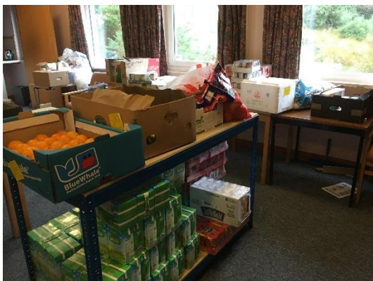
Fresh food in the village hall