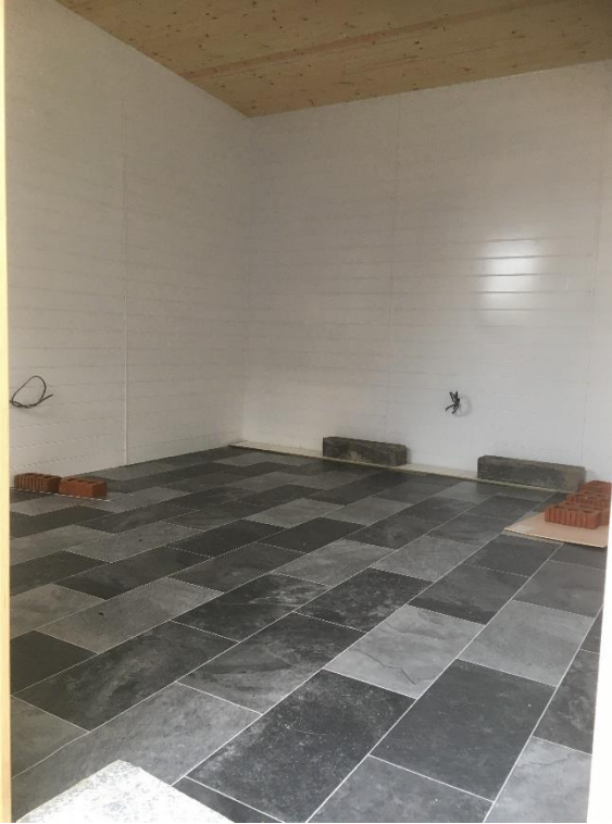
New Lochinver shed interior

There is a purpose built food larder in Lochinver by the Lesure Centre. It is now close to completion and will be open to any person requiring food in he Lochinver area. It will have timelock on so it will be closed for certain time periods. We will continue to work with Cfine but will extecd our range to include frozen and chilled goods in 2 new dedicated fridge and freezer.